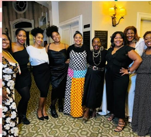
BLACK GIRL DREAM FUND