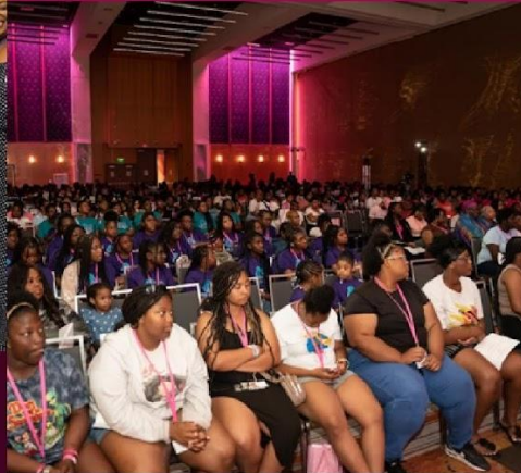
BLACK GIRLS DREAM CONFERENCE