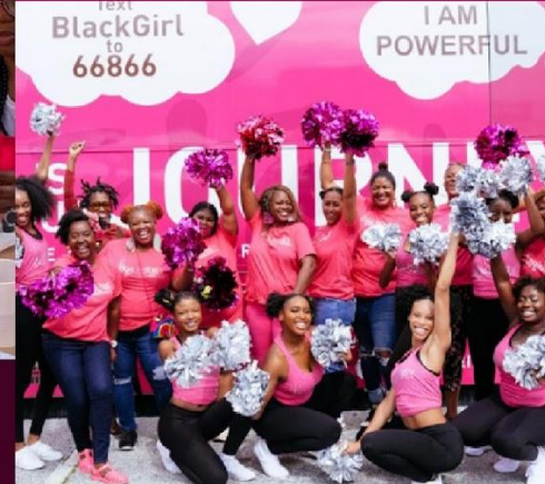
JOY IS OUR JOURNEY BUS TOUR