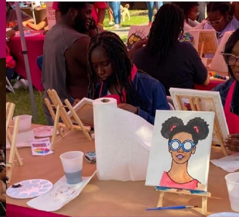
BLACK GIRL JOY CHALLENGE